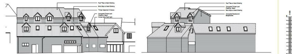
1 Proposed South Elevation 1:100 2 Proposed East Elevation 1:100