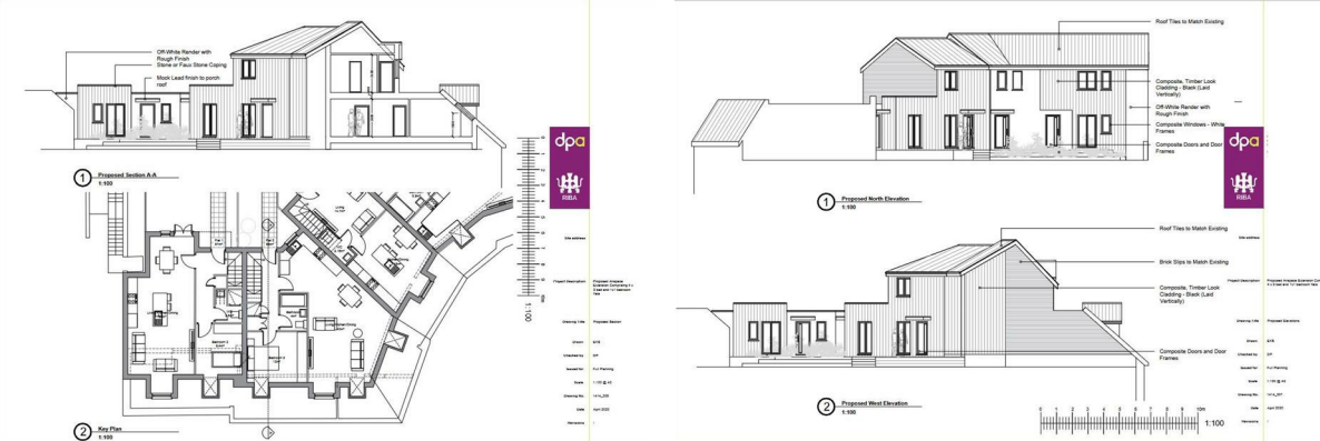
1 Proposed Section A-A 1:100 2 Proposed West Elevation 1:100